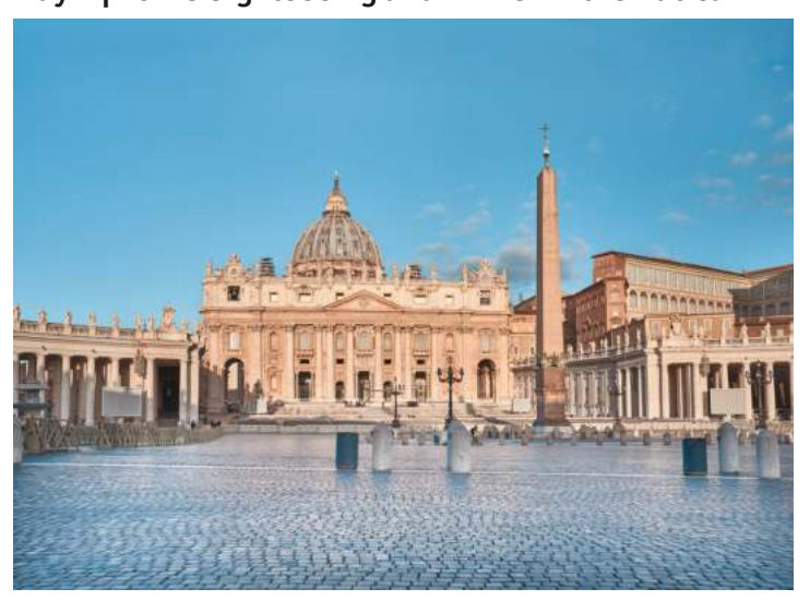
Day 2 | Rome Sightseeing and Dinner in the Vatican

In the morning enjoy the very best of the city's highlights including visiting the magnificent St. Peter's Basilica in the Vatican with your Local Expert. Cross the Tiber river to enjoy ancient Rome. See the incredible Circus Maximus famous for its chariot races, and the iconic Colosseum. In the afternoon, enjoy special fast-tracked entry into the Vatican Museums with a Local Expert. Admire the Papal art collection, before entering the Sistine Chapel to marvel at Michelangelo's masterpiece on its ceiling. Then you'll be privileged to an exclusive Highlight Dinner inside the Ethnological Museum.