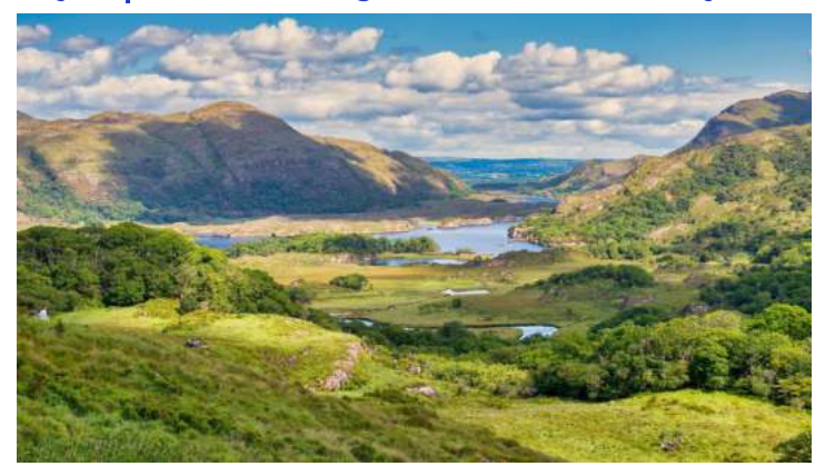
Day 13 | Shannon - Dingle Peninsula - Co. Kerry

See the Ireland you've only encountered in pictures and on the big screen until now. Your drive around the stunning Dingle Peninsula reveals a land of stone monuments, wild beaches and verdant pastures. See tiny Gaelic settlements, colourful fishing villages and landscapes that 'catch the heart off guard', in the words of Irish poet, Seamus Heaney. Later arrive in Tralee in County Kerry, where the Rose of Tralee International Festival attracts 'lovely and fair' Irishwomen from around the world to compete for the crown of 'Rose'. A fitting way to end the day would be to join an Optional Experience with the Gaelic Roots show of Irish dancers. Embrace the spirit of old Ireland life and times and enjoy a hearty Irish meal.