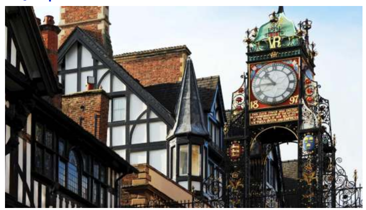
Day 8 | Wrexham - Chester - Dublin

See the legacy of Roman rule during this morning's visit to the ancient walled city of Chester. You'll view its defensive 1st-century walls and the characteristic black and white half-timbered buildings, famously known as 'The Rows' before heading to the west coast. Cross St. George's Channel to Ireland and its youthful capital, Dublin. You'll arrive just in time for an Optional Experience at a local restaurant-pub that will deliver the craic for which Ireland is so renowned.