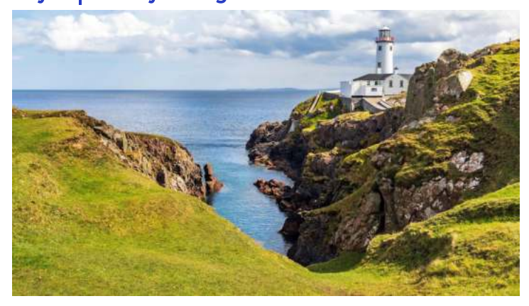
Day 11 | County Donegal excursion

Leaving civilisation behind for the day, your scenic drive through County Donegal will deliver a multitude of dramatic landscapes. Golden beaches, rugged cliffs and uninhabited islands dot your route so keep your camera at the ready to capture these perfect gifts of Mother Nature. Nothing says sophistication quite like fine porcelain and this afternoon's visit to Belleek Pottery reveals over a century of craftsmanship and art, the results of which can still be seen on dining tables the world over.