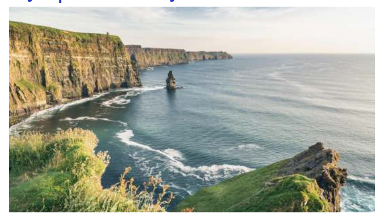
Day 12 | Ballina - Galway - Cliffs of Moher - Shannon

Galway's ancient reputation as a 'place of foreigners' is long gone, but much of its captivating heritage remains as you'll see first-hand during a stroll around Eyre Square. View Galway Cathedral, then leave the city behind for the plunging Cliffs of Moher. Take a deep breath and let the fresh sea air fill your lungs as you peer over the edge of the emerald-topped cliffs to the crashing waves of the Atlantic below. With a squint you may just be able to see the distant Aran Islands, but without much effort you'll spot the curious and colourful beaked puffins which are eager residents of the area. You'll visit the interactive Cliffs Exhibition before heading to your hotel in Shannon.