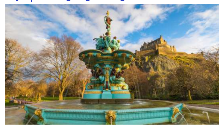
Day 3 | Edinburgh sightseeing and free time

Poets, writers, kings and queens have all found it impossible to resist Edinburgh's allure. From its medieval Old Town to the elegant Georgian façades across the Leith, you'll soon discover why it captured the hearts of so many famous people throughout the ages. Your Local Specialist reveals all the colourful tales of 'Auld Reekie' as your sightseeing tour rolls past the Palace of Holyroodhouse, the Royal Mile and Edinburgh Castle, perched atop Castle Rock. Explore the city your way during your free afternoon or consider joining one of two special Optional Experiences, discovering Rosslyn Chapel or exploring what lies behind the impenetrable walls of Edinburgh Castle. Don your tartan if you please this evening. Tonight, choose to visit the ancient village of Torphichen, where Knights Hospitaller once settled.