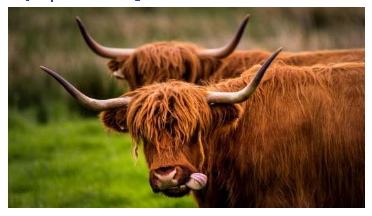
Day 5 | Scottish Highlands excursion

Straight out of a scene in 'Outlander', the Scottish Highlands has a mystical air about it which you'll come to discover as you explore its rugged beauty, evocative history and enchanting Highland ways. On your visit to Loch Ness this morning, keep a keen eye out for 'Nessie' before arriving in Inverness, the capital of the Highlands. Today's poignant highlight is a visit to Culloden, where Bonnie Prince Charlie's brave clansmen fought in the 1745 Jacobite Rising. Return to your hotel in the Highlands for dinner